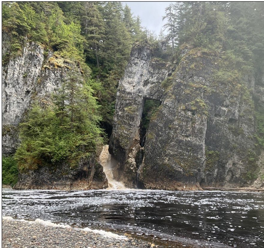
Figure 1.—Barrier falls at waypoint 121.